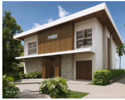
VILLA TANGERI #5